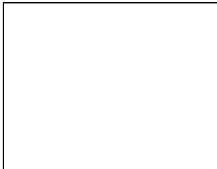
Photograph of Candidate

The signature and the photograph of the above- named Thiru/Tmt / Selvi..... are attested below