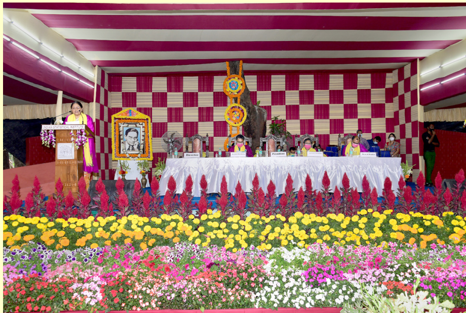
56th Convocation of the INDIAN Statistical Institute, Kolkata, 2022